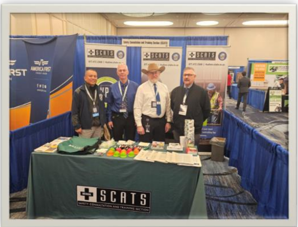
Las Vegas Preview – January 2024